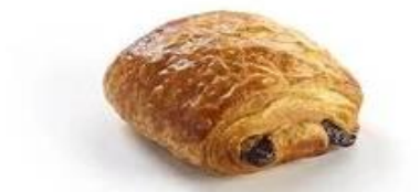
Pain Au Chokolat - Chocolate Roll with Butter

Product code: 2093 Unit size: 75 g Case barcode: 5412632515916 Case configuration: 70 x 75g Shelf life: 365 Days