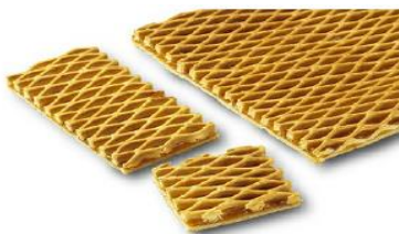
Jam Pastry Sheet

Product code: 2160 Unit size: 40 g Case barcode: 5412632509298 Case configuration: 110 x 40g Shelf life: 450 Days