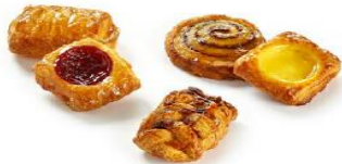
Mini Danish Mix

Product code: 2158 Unit size: 105 g Case barcode: 5410683145106 Case configuration: 20 x 105g Shelf life: 180 Days