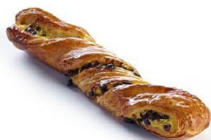
Chocotwist Chocolate Belgium Croissant

Product code: 2154 Unit size: 100 g Case barcode: 5412632516487 Case configuration: 60 x 100g Shelf life: 365 Days