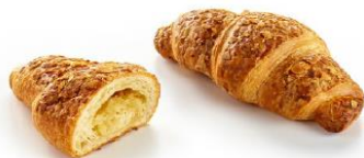
Butter Croissant with Almond Filling.

Product code: 2154 Unit size: 100 g Case barcode: 5412632516487 Case configuration: 60 x 100g Shelf life: 365 Days